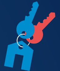
Number of dwellings built per 10 000 inhabitants, 2023